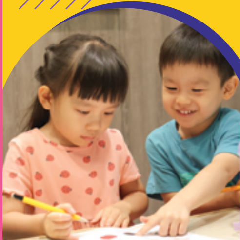
Language & Enrichment