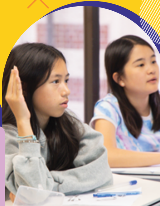
Tuition & Test Prep